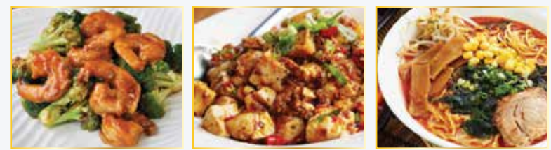
芥蘭蝦仁 Shrimp w. Broccoli | 麻婆豆腐 Stewed Bean Curd w. Minced Beef in Pepper Sauce | 擔擔麵 Spicy Hot Ramen

Food Allergies? If you have a food allergy, please speak to the owner, manager, chef or your server