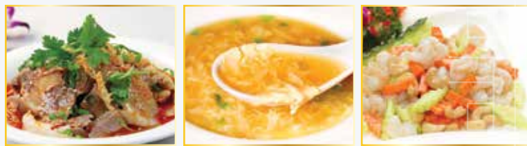
夫妻肺片 Ox Tongue & Tripe w. Spicy Pepper Sauce | 雞蛋湯 Egg Drop Soup | 腰果蝦仁 Shrimp with Cashew Nuts